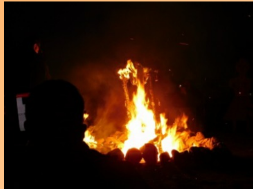
Before and After pictures of Quartzfest 2020's Burning Ham Man