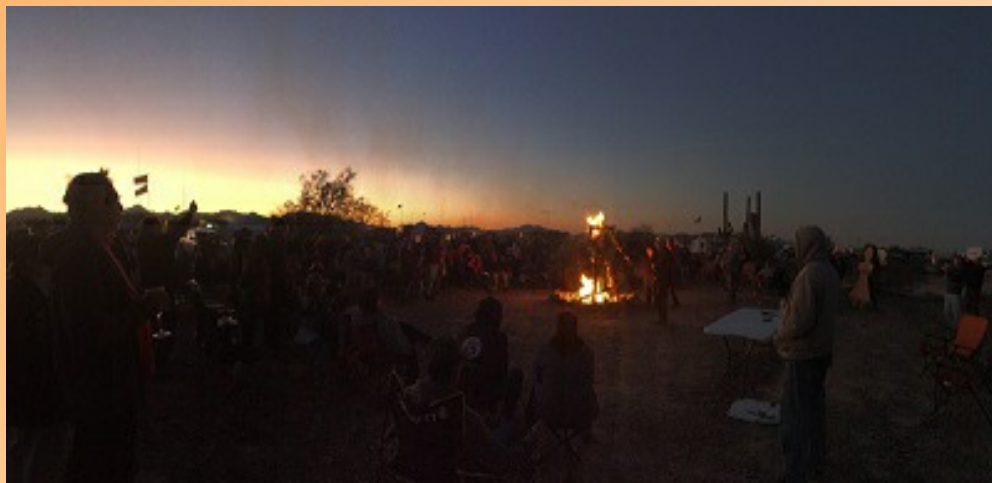
Panorama of "Burning Ham" at Quartzfest 2020