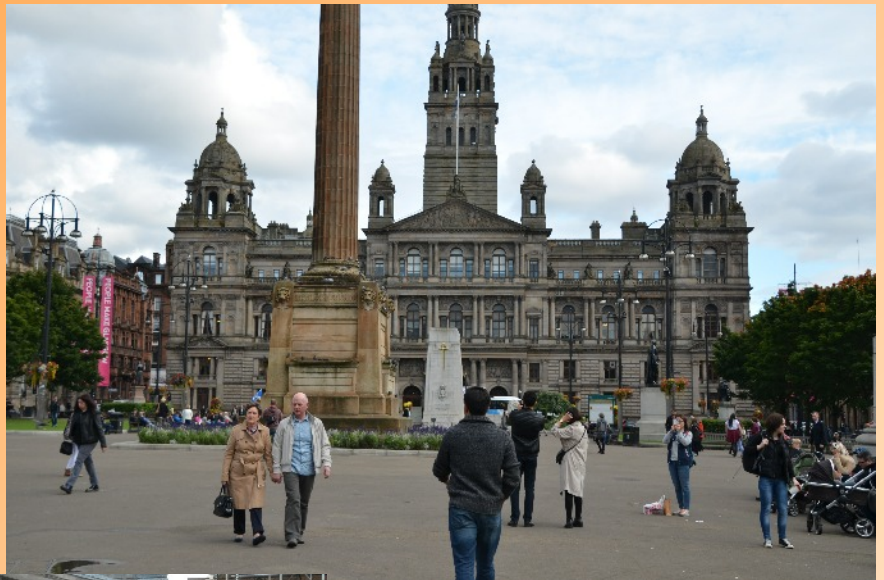
GLASGOW MAIN GOVT BUILDING IN KING GEORGE SQUARE