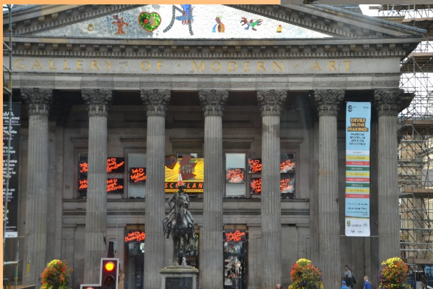
GLASGOW MUSEUM OF MODERN ART