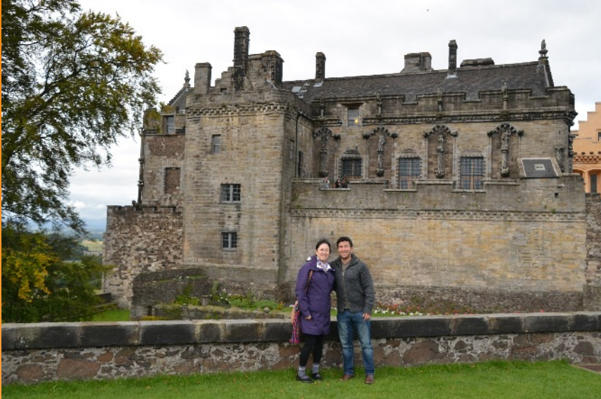
THESE PICTURES ARE FROM STIRLING CASTLE BIRTH PLACE OF MARY QUEEN OF SCOTTS