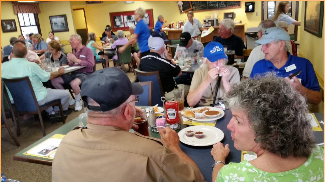
LUNCH AT BUSH BEANS FACTORY

USE THIS LINK TO SEE SYSTEM MEMBERS AT THE TEN TEC TOUR DURING CONVENTION