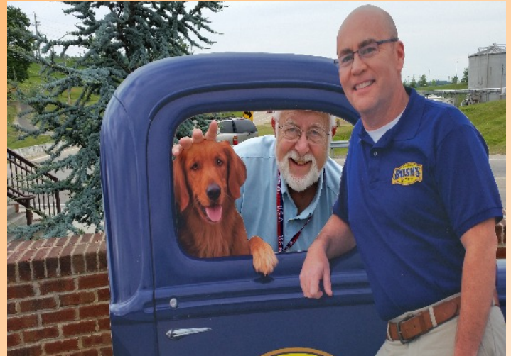
DUKE SPILLED THE BEANS TO W7AJP AT BUSH BEANS FACTORY