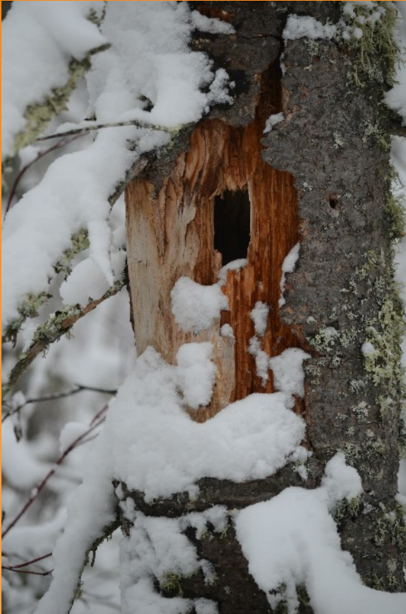
WOODPECKER HOLE TAKEN AT THE CABIN OF K9DIG #16336 BY HER OM