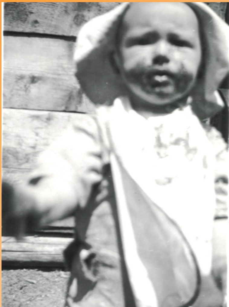
KL7FQQ # 6098