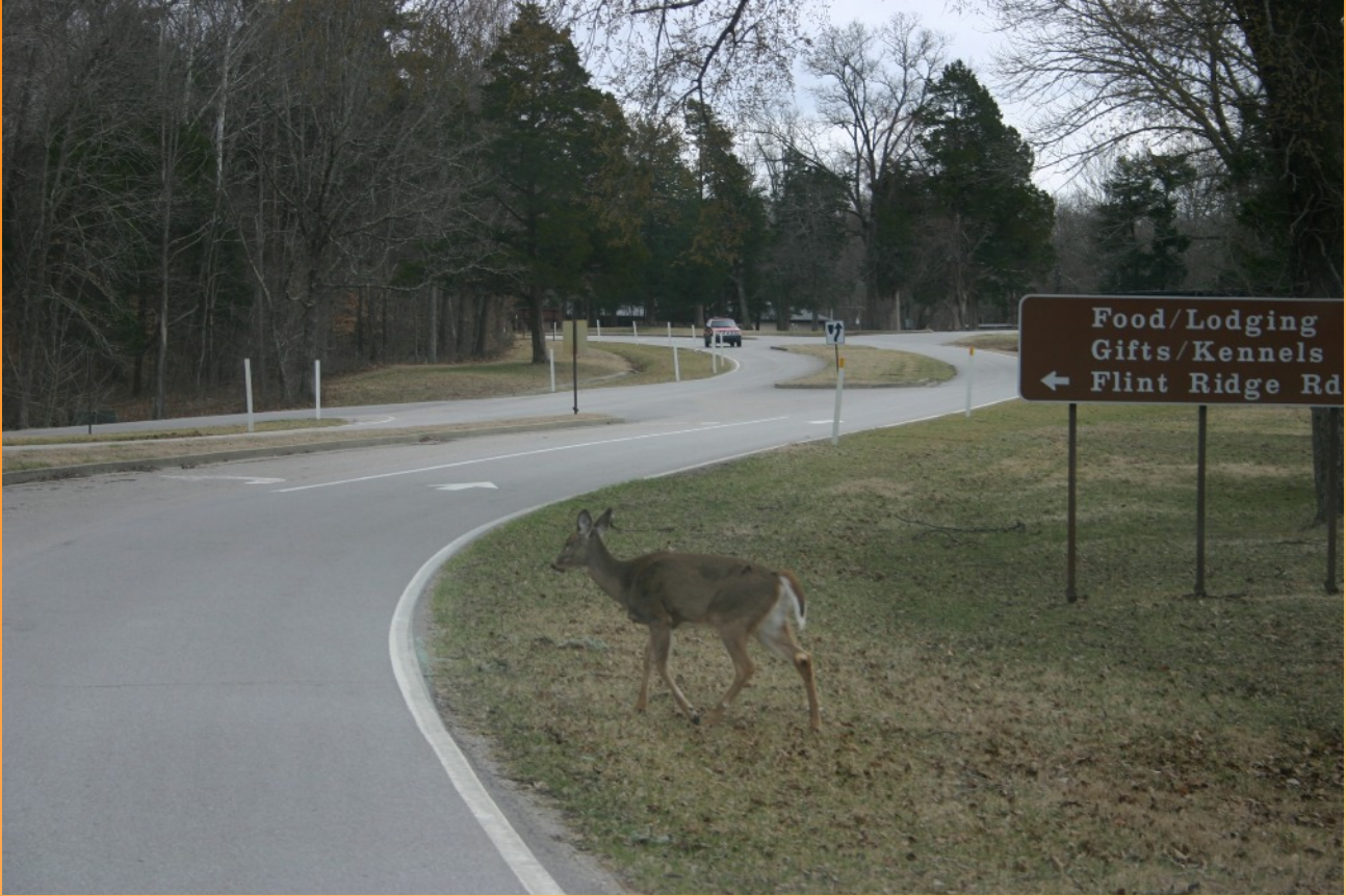
BOTH OF THESE PICTURES WERE TAKEN AT MANMOUTH