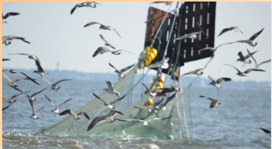
SHRIMP BOAT HILTON HEAD - PULLING IN CATCH