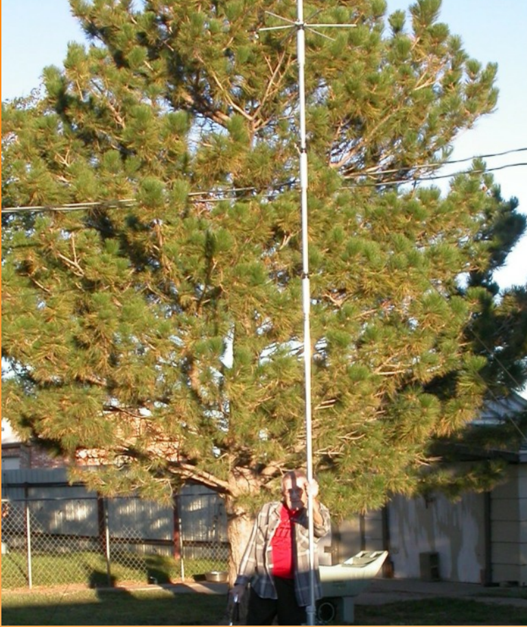
K5BOO BY HIS ANTENNAE