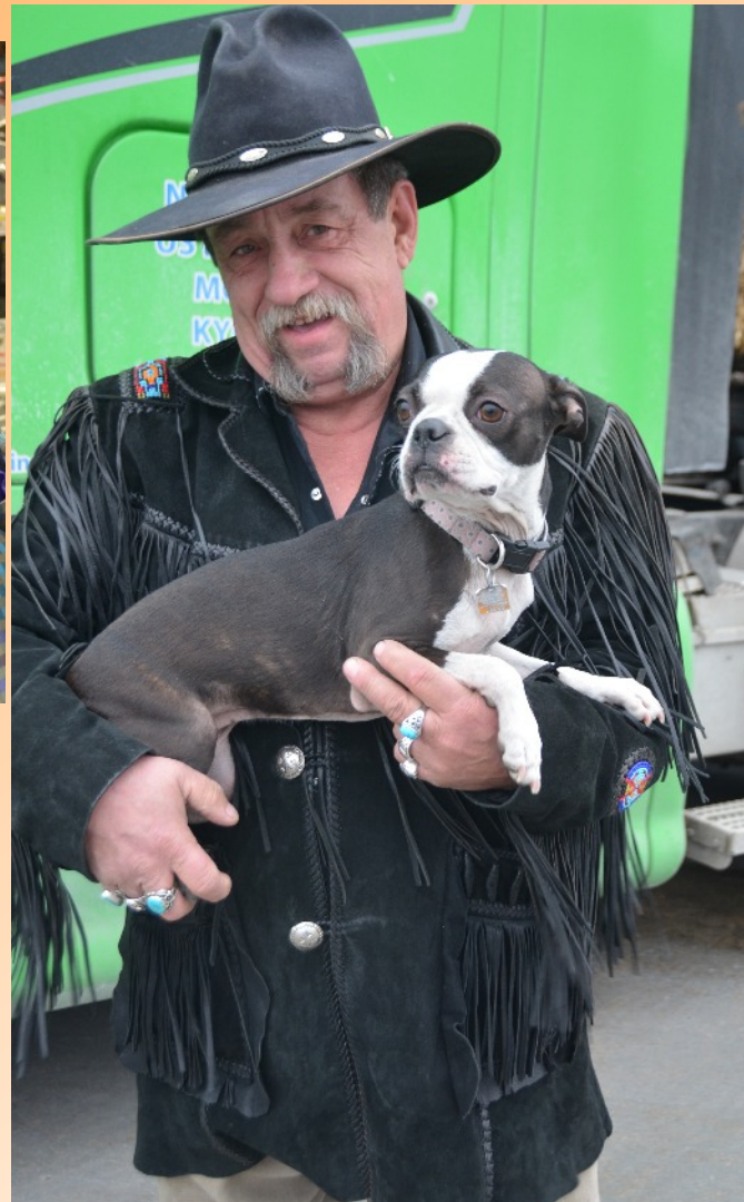
MIKE'S DOG IS ROXIE