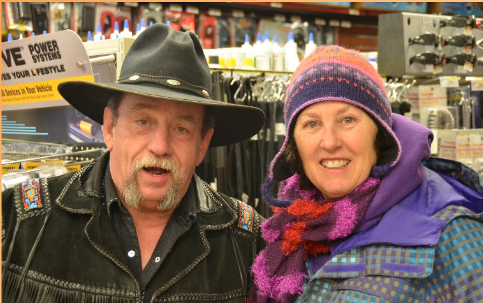
K9DIG AND VE2XMP IN GRAND FORKS ND AT THE FLYING J NOV '13