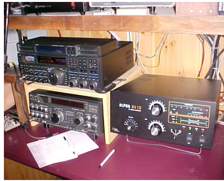
K7HKs NEW ALPHA