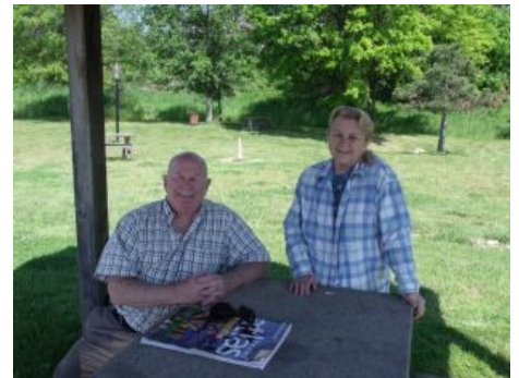
KC2ATK & SALLY