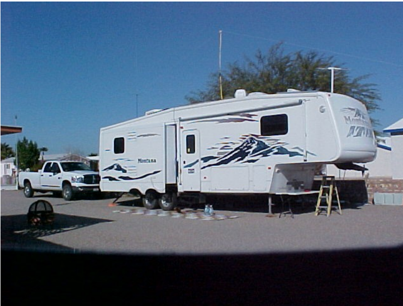
Winter home for K7HK & W7DZX at Quartzsite in AZ.