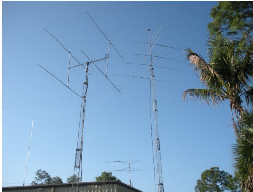
ANTENNA ON RIGHT USED BY AA4GT DURING PENNSYLVANIA QSO PARTY