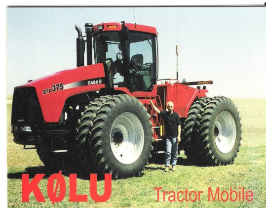
LEON TRACTOR MOBILE