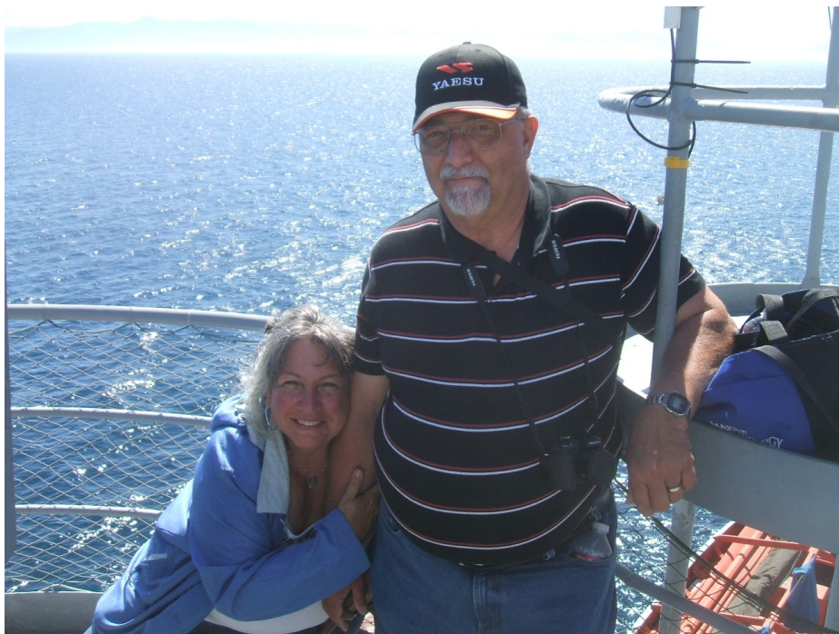
What a great photo this is on the left: