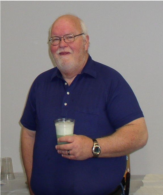
BUB W5BUB #4183 CEDARVILLE AR