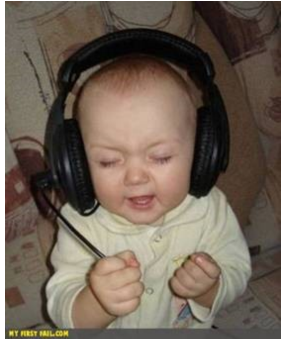
YES, I FINALLY GOT MY LAST STATE!