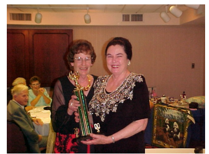
KU7F - SK - N0TWV