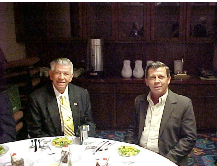
KP3B - W5HNI