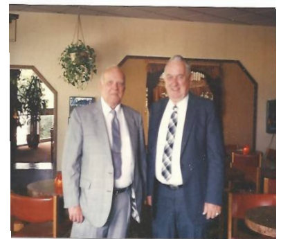
WB7CEH-SK - AA4GT