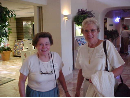
WD5FQX - WB9USL-SK