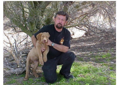
LITTLE JOE & K7HK