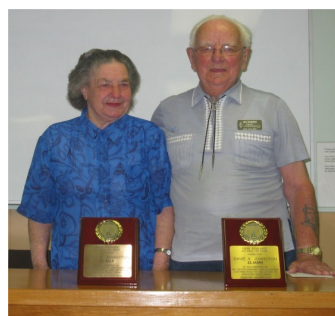
ZL1ALE - ZL1AMN