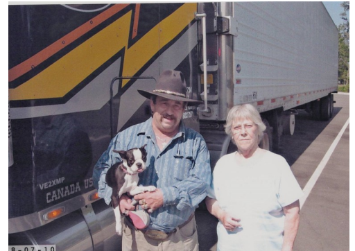
VE2XMP - KC8VRT