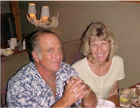
N4ZGH - N4KNF - SK