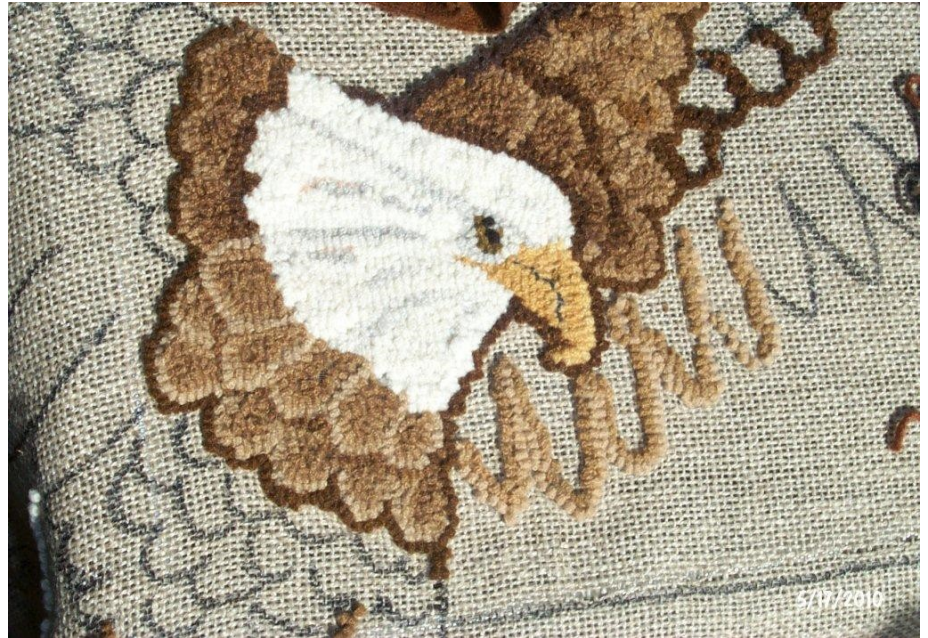
BEAUTIFUL WORK DONE BY MARILYN WN9MFC