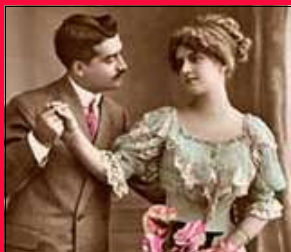
Will you be my Valentine