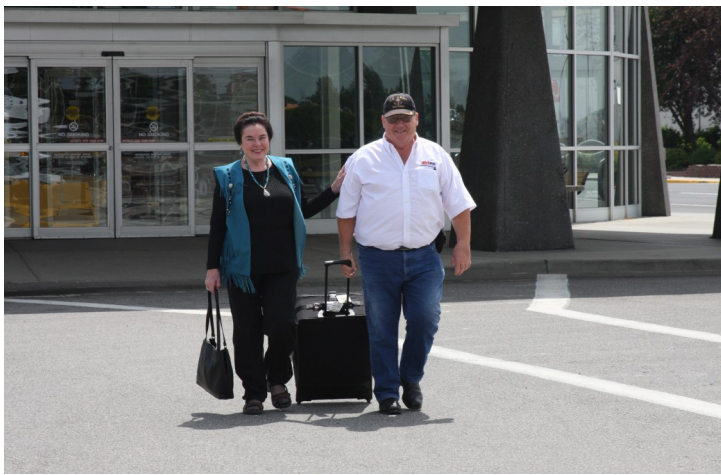
LOST & FOUND IN SPOKANE VALLEY