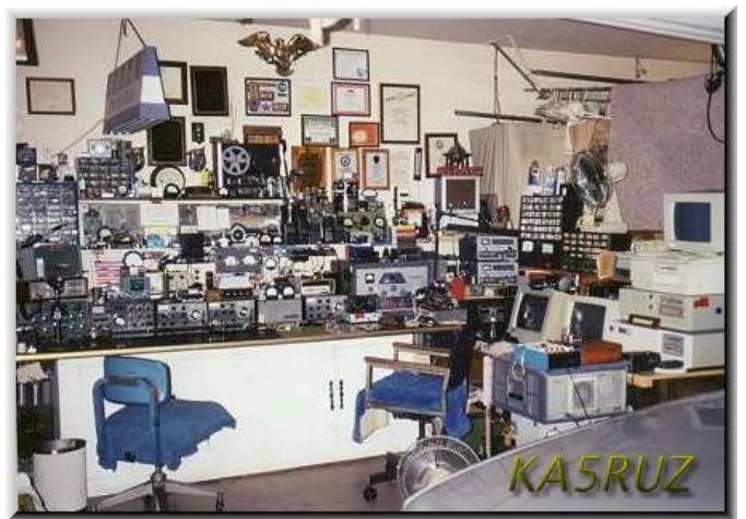
RALPH'S SHACK IN OKLAHOMA