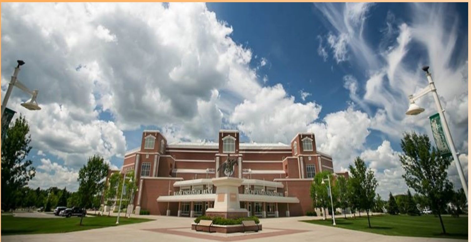
RALPH ENGELSTAD ARENA

THERE IS A FREE SHUTTLE FROM THE AIRPORT AS WELL AS A SWIMMING POOL AND INDOOR MINIATURE GOLF AT THE HOTEL.