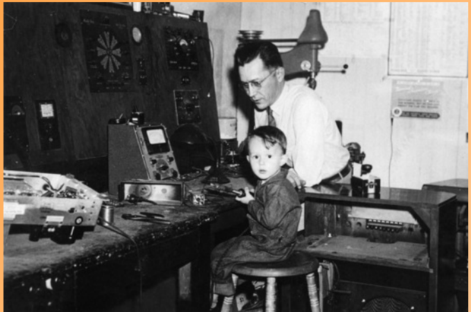
A future "Expert Radiotrician"