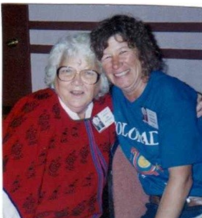
KB5YQ & W7DZX